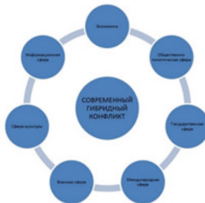
Figure 3. The Concept of Hybrid War in Russia's Strategies (Kurban, 2019)

However, as can already be seen on the Graphical abstract, the authors of this paper insist on the phased development of hostility and preparation for the start of a hybrid war. Undoubtedly, when a conflict escalates, all available means and measures are used simultaneously, but in order for a conflict to escalate, it is necessary to carry out preparatory actions beforehand.