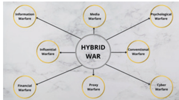
Figure 2. The Concept of Hybrid Warfare in India's Strategies (Indian Foreign Affairs, 2021)

can be seen in the description of hybrid war by NATO (Figure 1), Indian state institutions (Figure 2) or certain Russian authors (Figure 3).