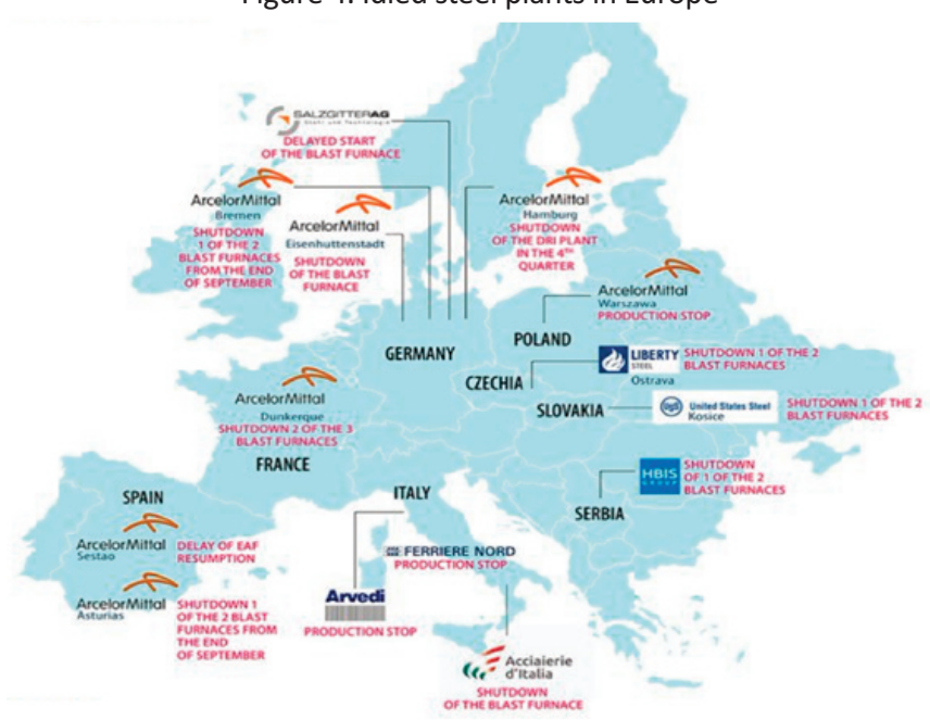
Figure 4. Idled steel plants in Europe